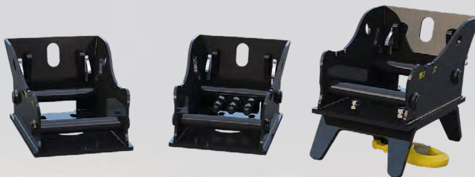
MECHANICAL TOOL ADAPTER